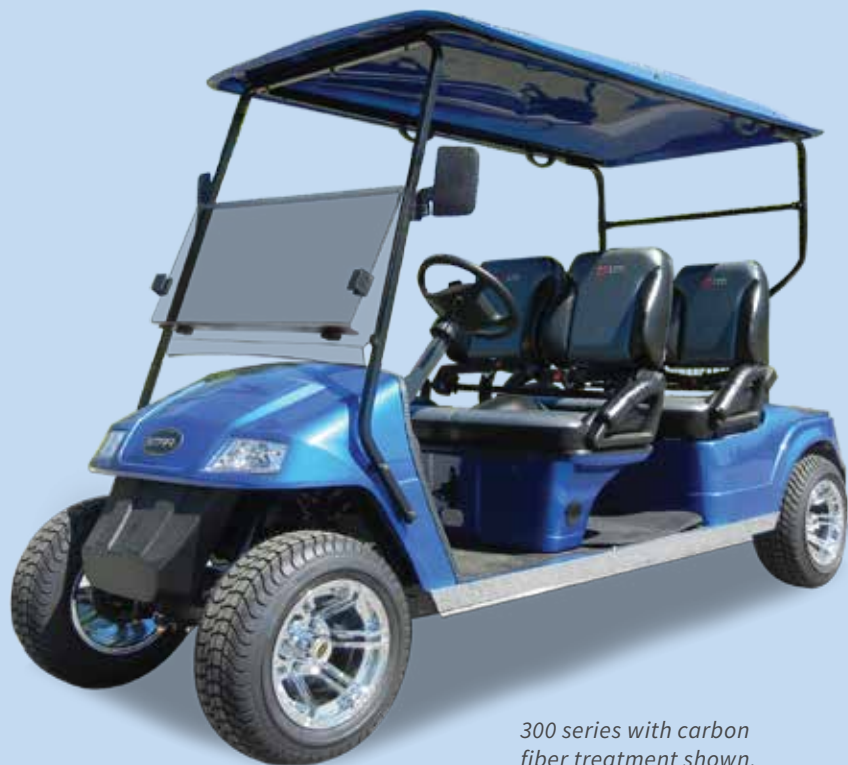
300 series with carbon fiber treatment shown.

SS Limited models come with two-tone color complemented Suite Seats, 12" chrome SS wheels, chrome rocker panels, special metallic paint colors, SS badging, glove box, and plush black carpet throughout the cab. SS Limited—another definition of cool.