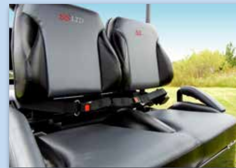
Deluxe two-tone, color-matched SS Limited seat cushions