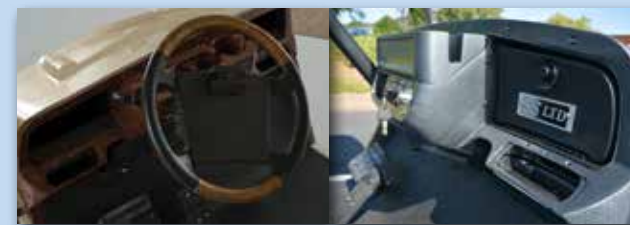
Wood grain or carbon fiber treatment