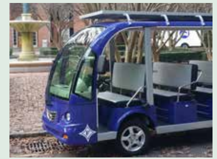
Roof-mounted solar panels (custom color shown)