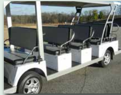
Spacious seating with seatbelts for protection