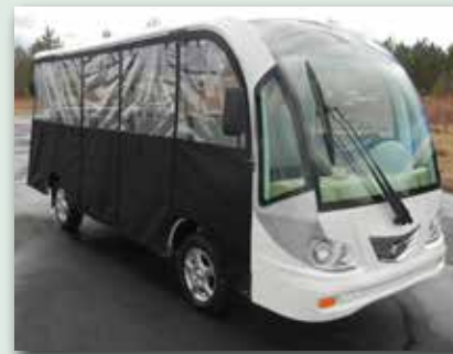
Sunbrella vinyl enclosure