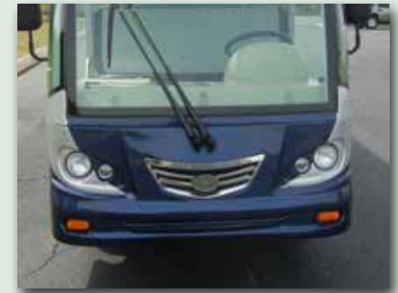
Stylish STAR EV exclusive front design with chrome finish grill (custom color shown)