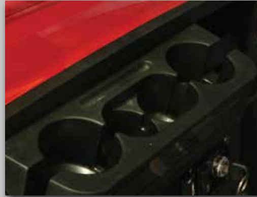
Four front cup holders