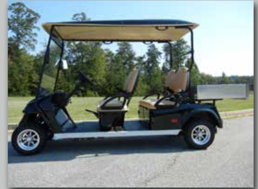
Also available as 2 or 4 passenger