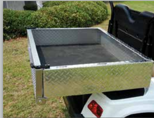
Heavy-duty recycled tire insert