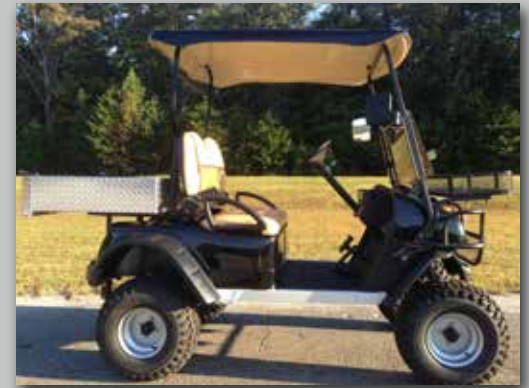
Also available as lifted model (STAR Sport)