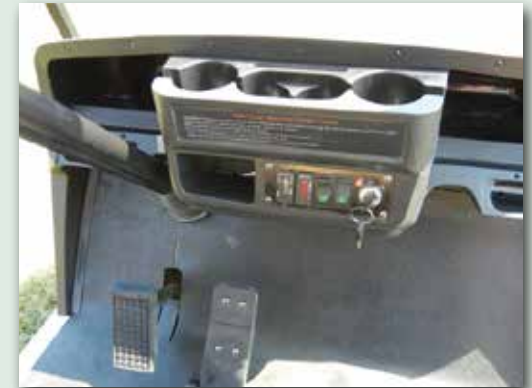
Up/down ramp switch allows on/off access with ease