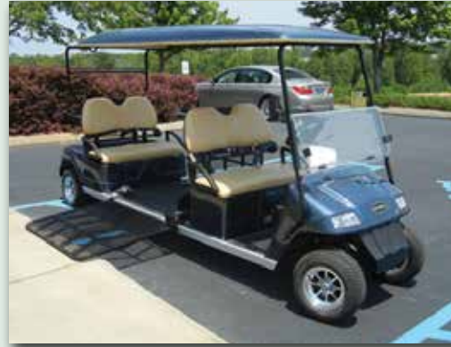
Automatic hydraulic ramp