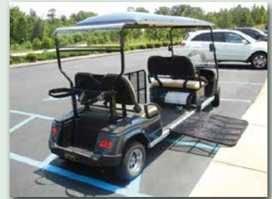
Storage in the back